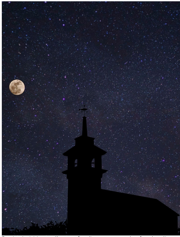
Evening Activities usually start after dinner, some may be after chapel!

A Leader to recruit many volunteers to run the Talent Show on Saturday Night. The "talent" will sign up at the Writing Desk. The Leader will determine who goes when, what equipment is needed and will "Emcee" the show. Other conferences will be invited to attend.