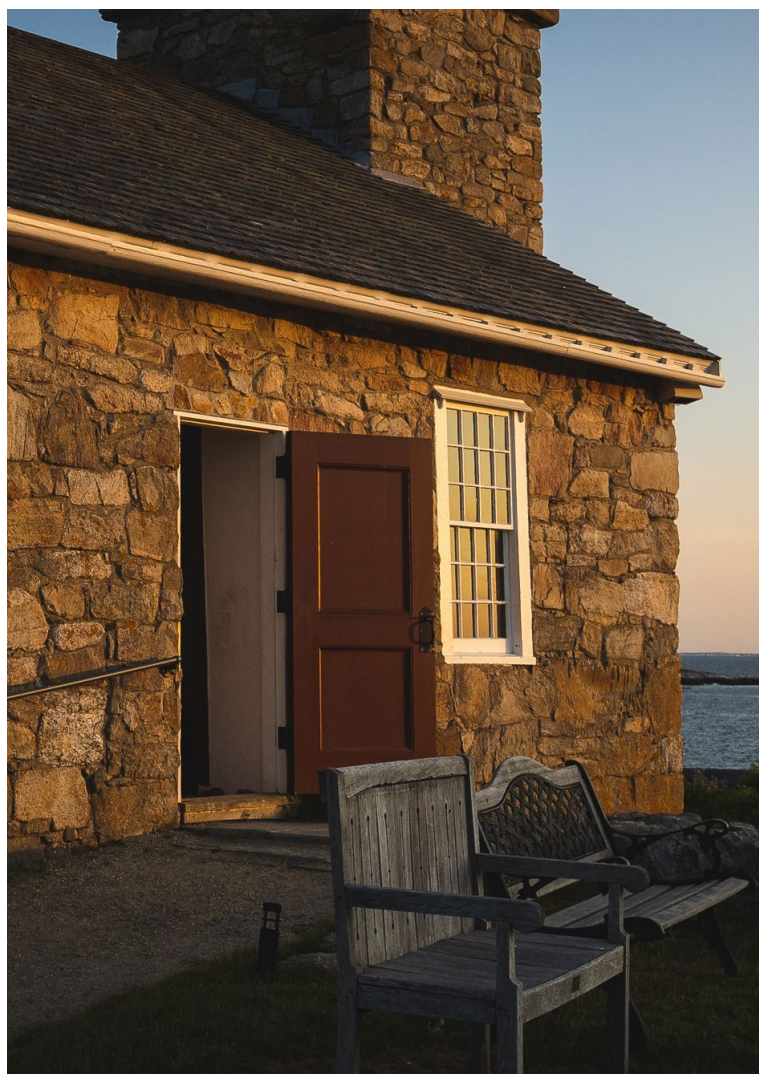
Stone Chapel 2024.