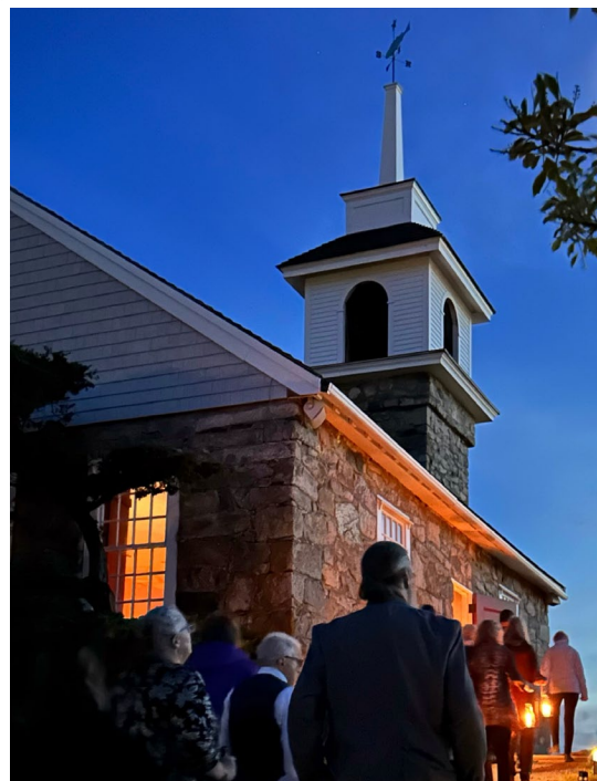
People entering the Chapel for the evening.