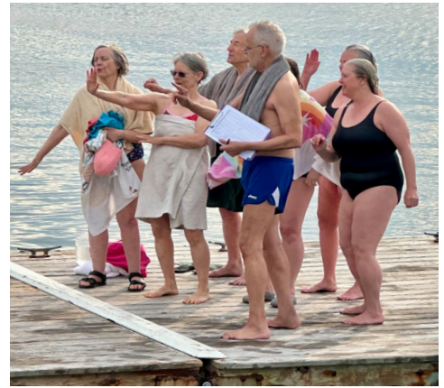
Arts Polar Bears are out every morning during our week in June.