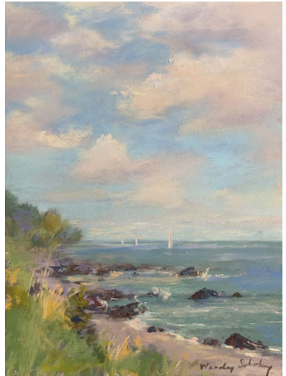
An example of Wendy's work.

Learn more about supplies and Wendy Soliday here: https://stararts.org/visual-arts/