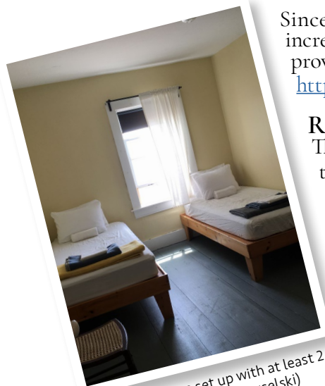
Most rooms are set up with at least 2 beds.