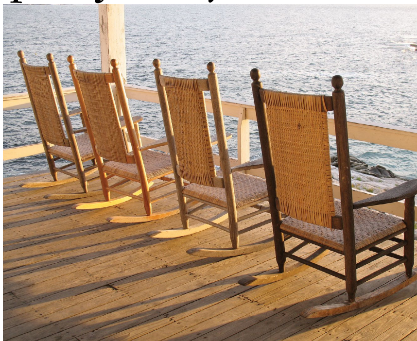
Rocking chairs on the porch waiting for you to return.