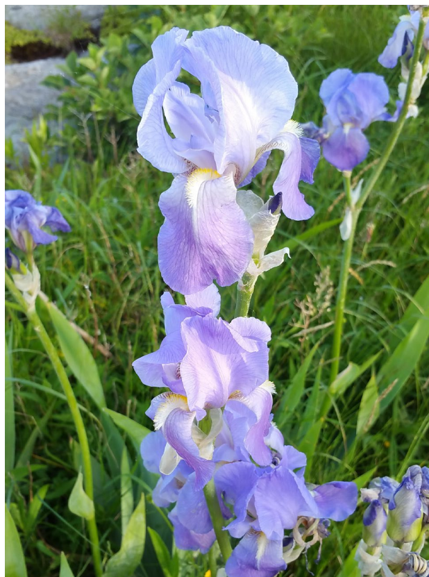
Blooming flowers await us on Star Island.