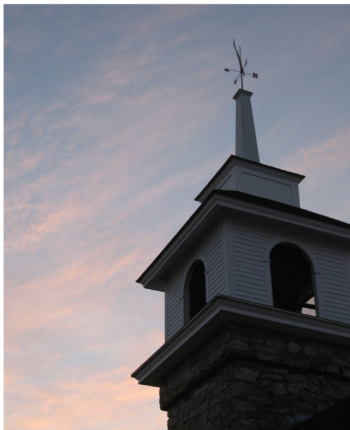
The top of the Stone Chapel where we will have morning chapel.