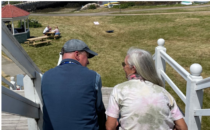
Maybe you'll make a new best friend! Know that you'll be helping a New Shoaler get acquainted with Star Island!

Happily, we have a flock of New Shoalers coming to Arts this year! Some have been referred by friends, others are workshop leaders, a few are Longtime Shoalers - new to Arts, and the rest - yup, totally new!