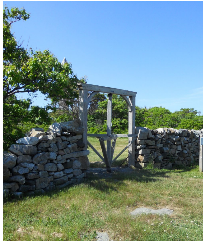
Star Island Turnstile 2022.

Questions: Contact Doug at: dgrichards44@comcast.net or 603.225.9062.