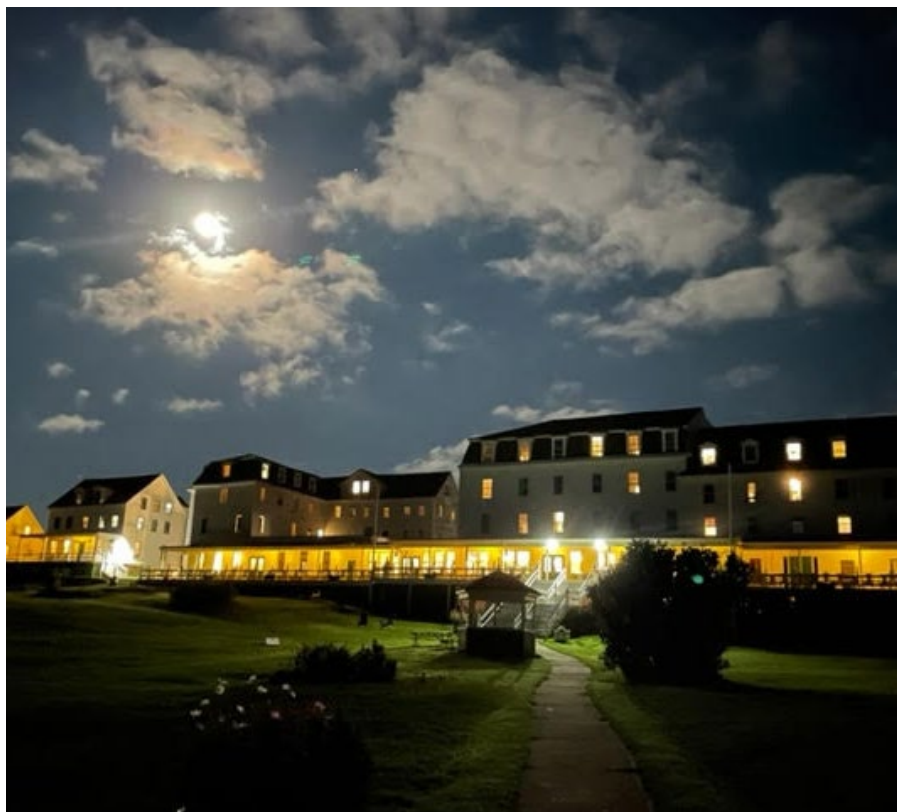
Star Island at night 2022.

the porch bell the lanterns the enduring love 6/16/22