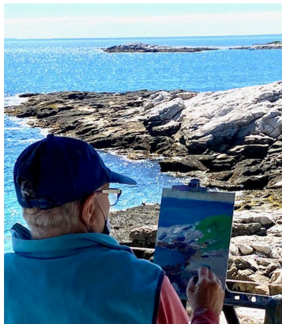
Outside painting is one of the joys of being on Star Island.