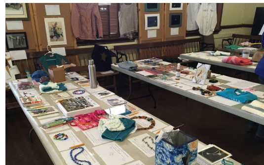
Silent Auction items ready for bids.